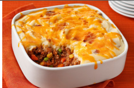
Cottage pie is an English meat pie made with beef mince and with a crust made from mashed potato. A variation on this dish using lamb is known as Shepherd's pie .